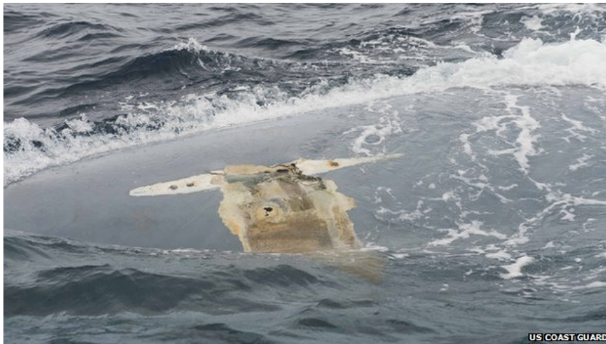
The US Coast Guard issued photographs of Cheeki Rafiki's upturned hull showing its keel had broken off

The wreckage of the yacht crewed by four UK sailors missing in the North Atlantic was found with its life raft still onboard, the US Coast Guard says.